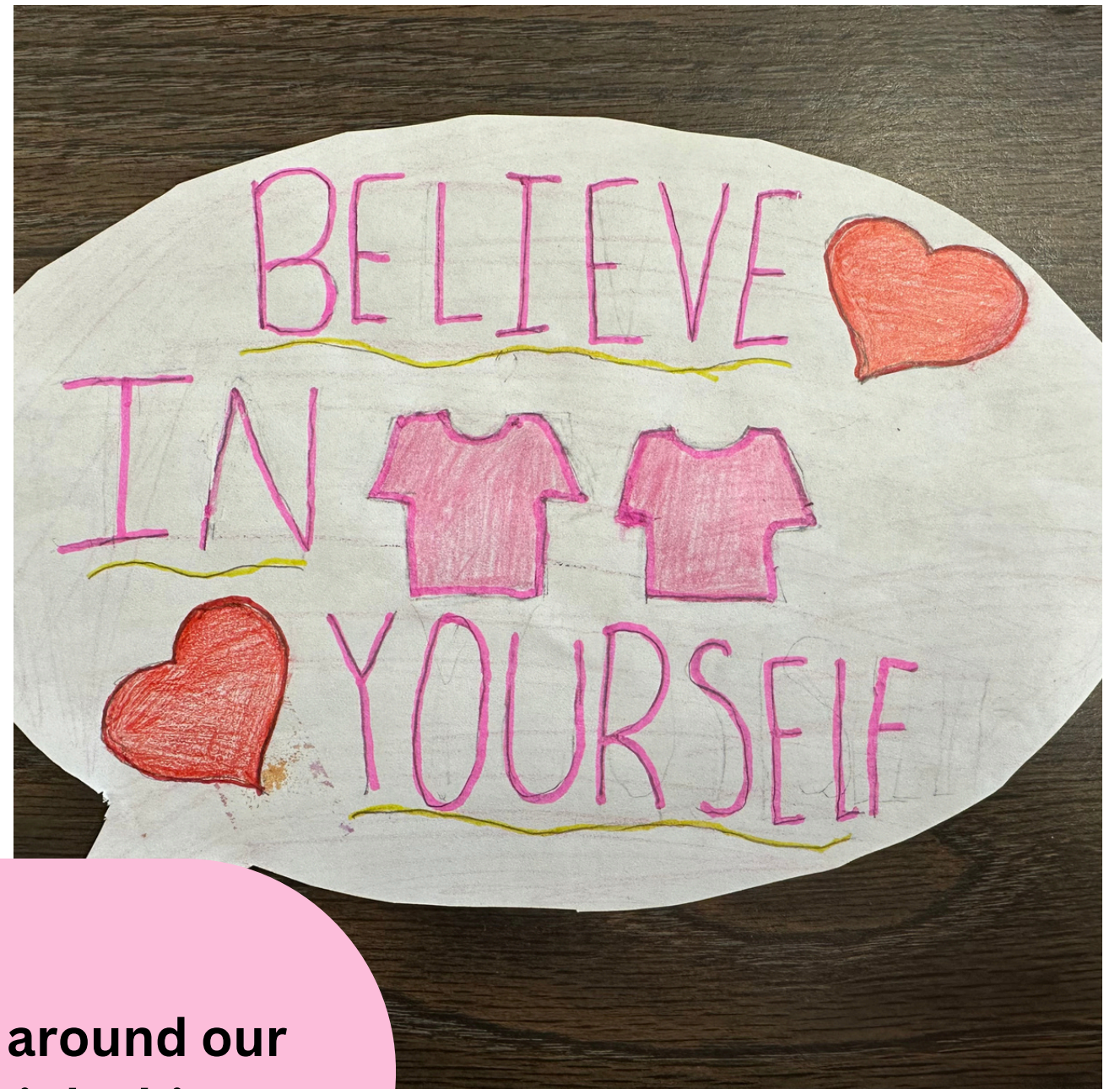
Student work from around our school inspired by Pink Shirt Day.