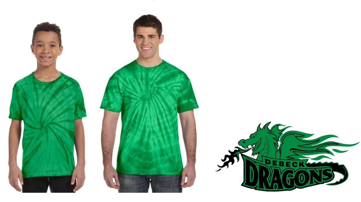
Spider Kelly Green Color Debeck Logo – Full Front – 2 Color Imprint $21.00 each