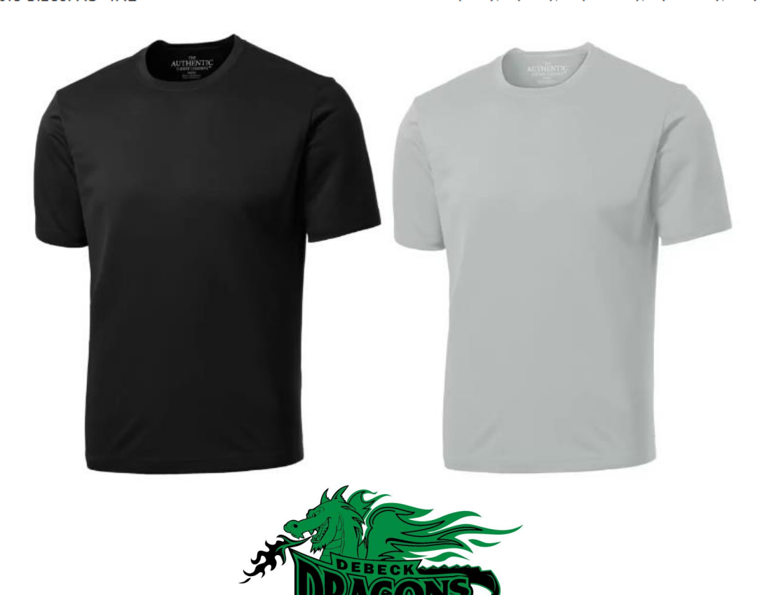
Debeck Logo – Full Front – 2 Color Imprint $18.00

Available Sizes: XS-4XL Youth Sizes: XS(2-4), S(6-8), M(10-12), L(14-16), XL(18-20)