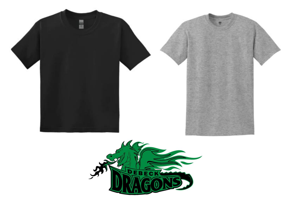
Debeck Logo – Full Front – 2 Color Imprint $14.00

Youth Sizes: XS(2-4), S(6-8), M(10-12), L(14-16) Available Sizes: S-5XL